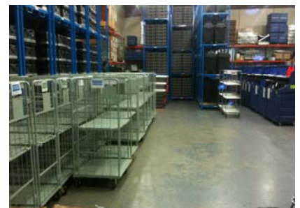
The VEF facility

Once the election is certified by the Canvassing Board and after the contest period ends (which is ten business days after certification), the tabulators and AutoMARKs are unsealed and removed from their cases. An audit tape is run from the tabulators for every precinct and early voting site. The memory cards are removed from the AutoMARKs. The green 'Voted Ballot' bags are unsealed and the voted ballots are placed in boxes marked with the precinct number and election date. These boxes are stored in an alarmed ballot room for 22 months. The flashcards and memory cards are returned to the Data Center at the Terrace Building where they will eventually be programmed for the next election. The tabulators and AutoMARKs are then cleaned and stored on pallets. This process takes approximately one month. So, long after election day, the staff at the VEF finally take their sigh of relief!